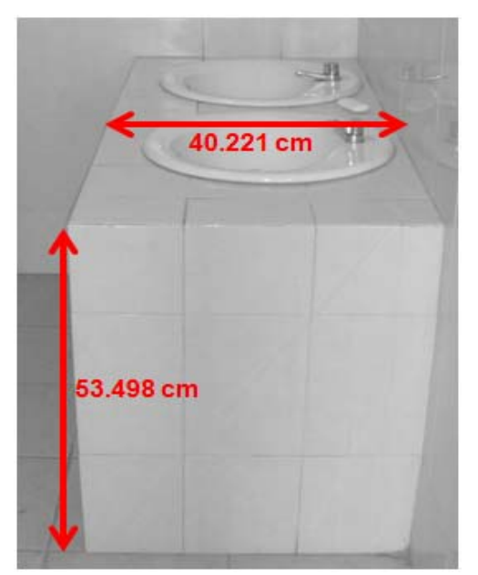
Figure 2. Sink dimensions

In order for most of the children to be able to use the sink without any problems percentile 5 from mean 949 and 752 was used.