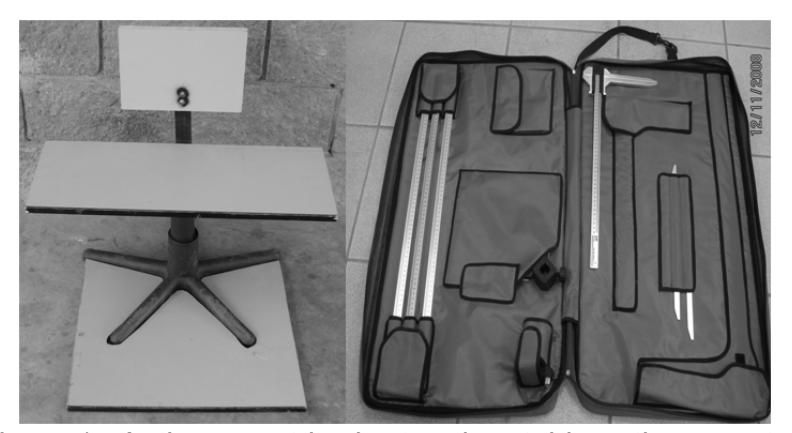
Figure 1. Anthropometric chart and portable anthropometer.